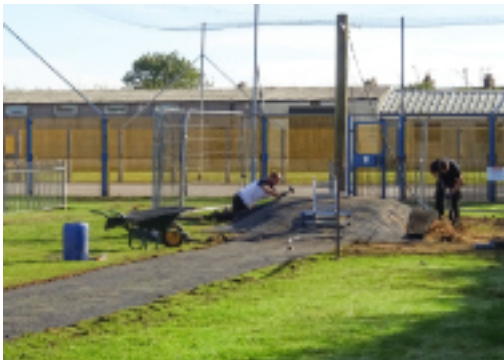
New Zip Wire being installed at Green Lane