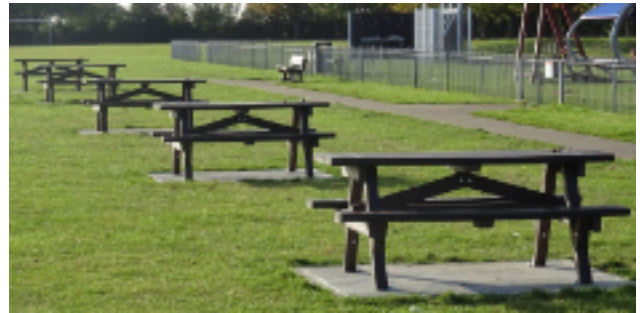
New Benches at Mill Lane

You may remember Councillors asking for signatures way back in 2018/19 for an all weather path around Mill Lane Park, unfortunately we were unable to secure that idea.