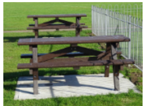
Two of the New Benches at Green Lane

I hope this article has been a little insight into what S106 is and what the volunteers on your Parish Council are trying to do.